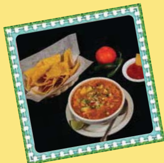
CALDO DE POLLO