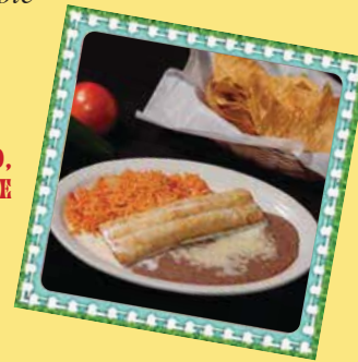
EL DORADO, LUNCH ENTREE